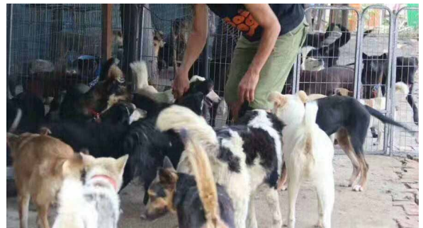
Hundreds of dogs have been rescued but are still in desperate need

Watch the rescued dogs' journey to safety